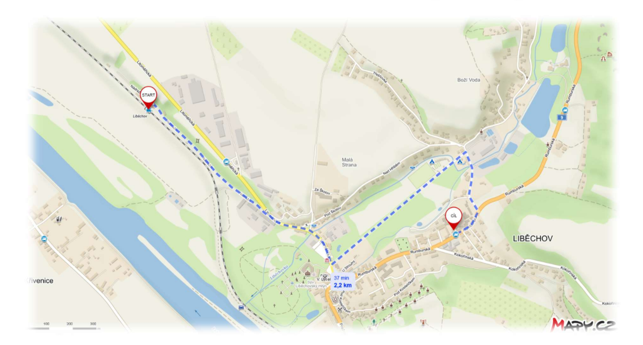
The journey from the train station to the Institute

The train station in Liběchov is rather far from the Institute (30-minute walk), however, train is also an option. You can look up rail connections at the following address: <a href="https://idos.idnes.cz/en/vlakyautobusymhdvse/spojeni/">https://idos.idnes.cz/en/vlakyautobusymhdvse/spojeni/</a>.