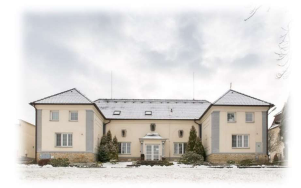
Institute of Animal Physiology and Genetics in Liběchov