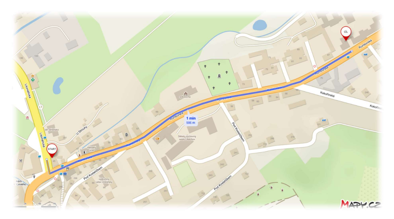
The journey from the bus station to the Institute

The best connection to Liběchov is from Prague, from Ládví station (underground, Line C) where you can take bus No 369, it takes about one hour. To see the bus timetable, please click on the following webpage: <a href="https://idos.idnes.cz/en/vlakyautobusymhdvse/spojeni/">https://idos.idnes.cz/en/vlakyautobusymhdvse/spojeni/</a>